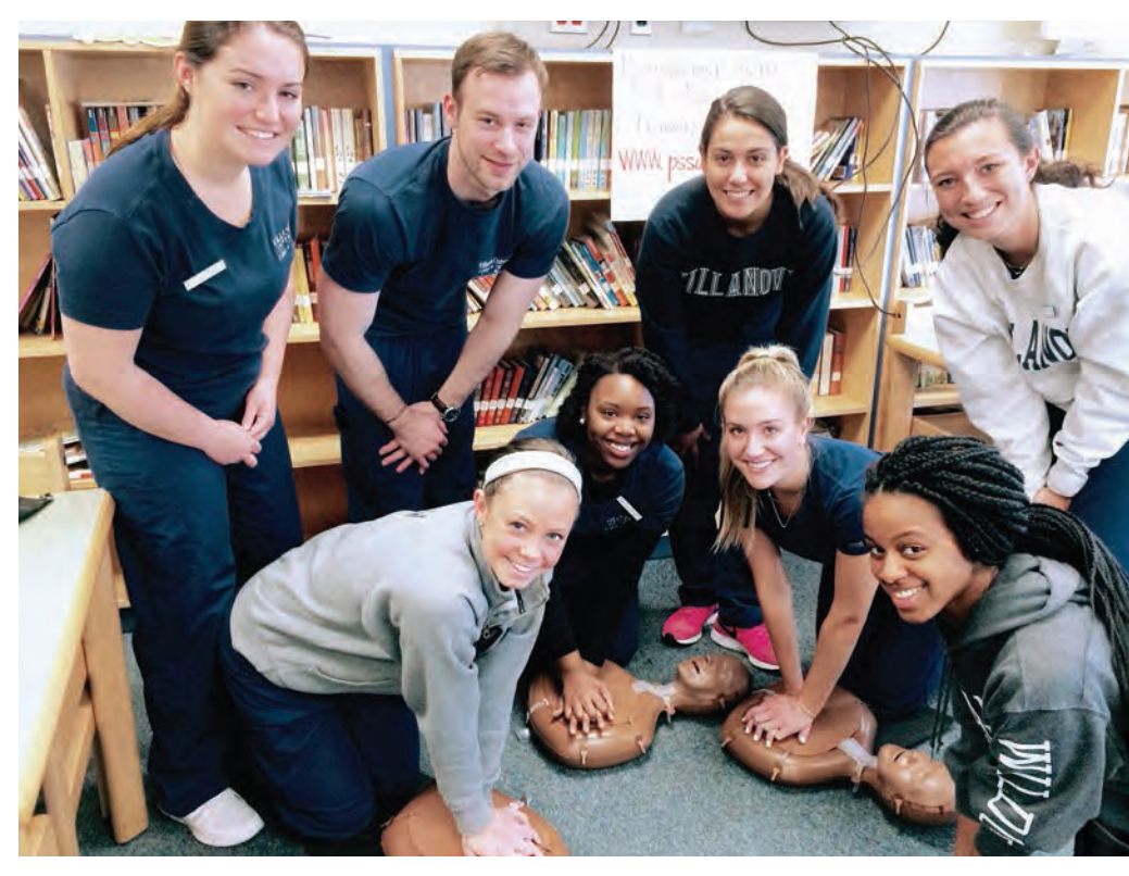
As part of a practicum this spring, seniors taught CPR at Delaplaine McDaniel Elementary School in Philadelphia. The mannequins were donated by the Ross clothing company, which provides CPR equipment to underserved areas.