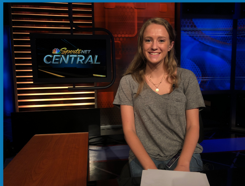
Cox as an NBC intern

"I have made the most of every day at Villanova, knowing that after last March, it can all be taken away in an instant."