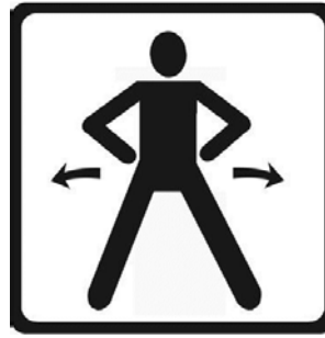
Leg Split Stretch