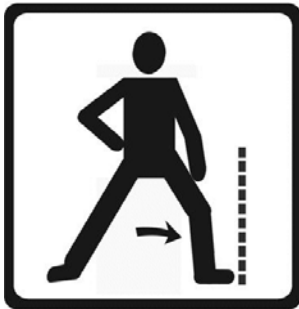
Standing Inner Thigh Stretch