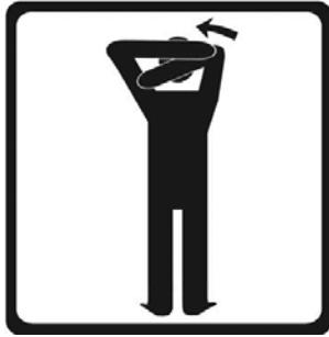
Shoulder Inferior Capsule Stretch