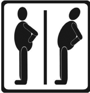
Standing Back Extension