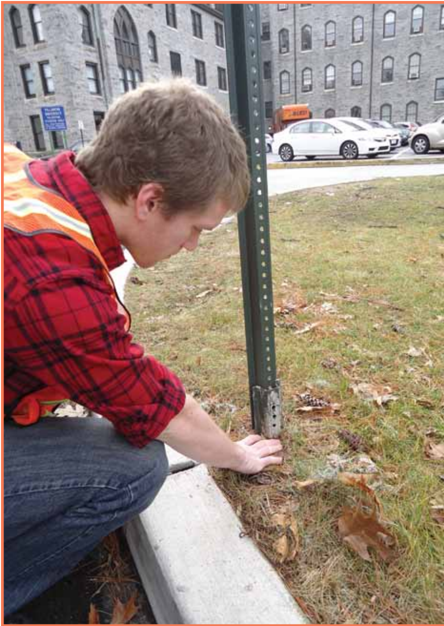
This student is inspecting a breakaway device mounted on a regulatory signpost to check for compliance with MUTCD requirements.