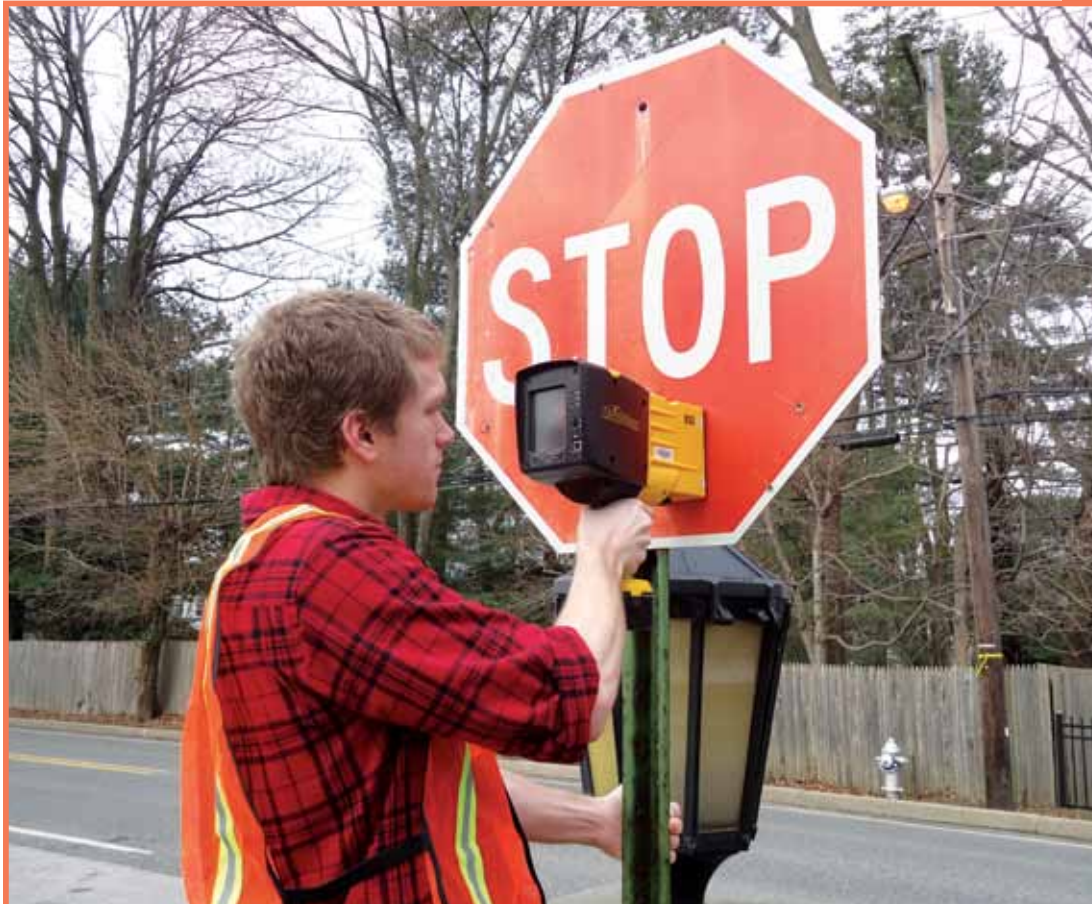
A student is using a retroreflector to conduct field measurements on this STOP sign to support data collection for the sign inventory database.