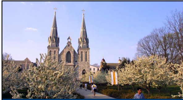
VILLANOVA UNIVERSITY M. LOUISE FITZPATRICK COLLEGE OF NURSING MACDONALD CENTER FOR OBESITY PREVENTION AND EDUCATION (COPE)