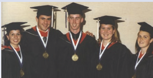
2003 Medallion Recipients