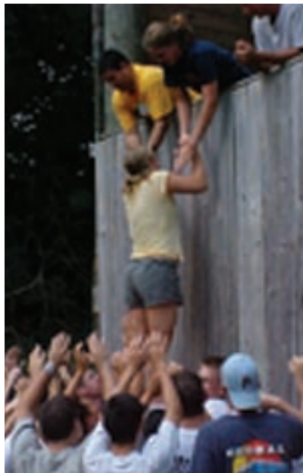
PEERS working together during one of the Villanova Ropes Course team building exercises

This past summer, thirty-three engineering students, sophomore through senior year, representing each of the five disciplines, applied