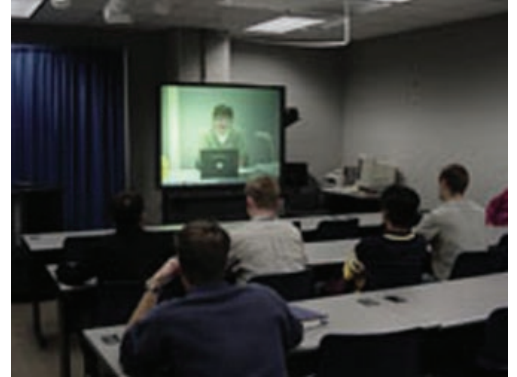
Distance Education Room in Tolentine Hall