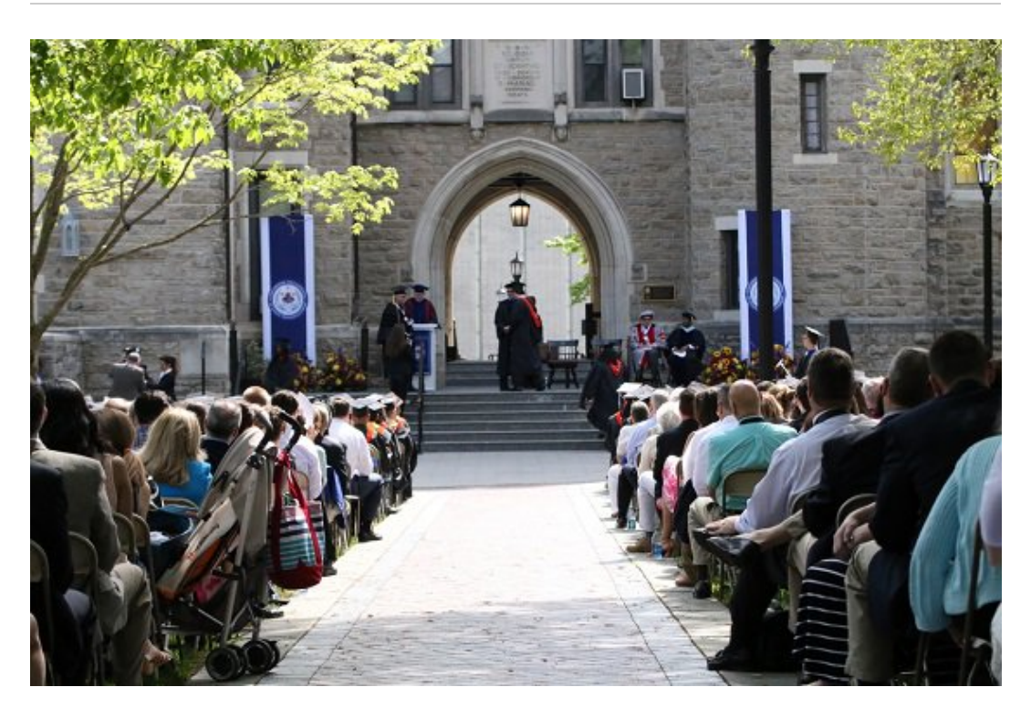
Sun Shines on 2016 Engineering Graduates

Enjoy your summer and this issue of protoTYPE!