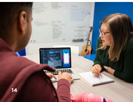
Cabrini Campus, Opening Fall 2026

We encourage you to let your Villanovan take the lead when it comes to their academic journey. Students should be their own advocates when it comes to choosing their academic path, completing assignments, contacting professors, studying and managing conflict. This independence and self-support is an important part of your student's journey into adulthood.