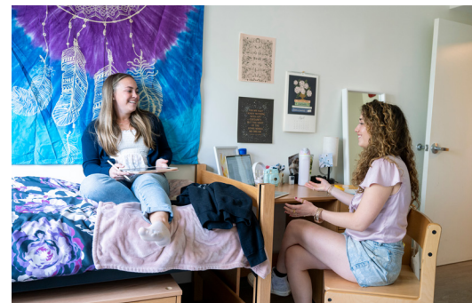
Cabrini Campus, Opening Fall 2026

Next spring, your Villanovan will select housing for the 2026-27 academic year; this will include options on the Cabrini and Villanova campuses.