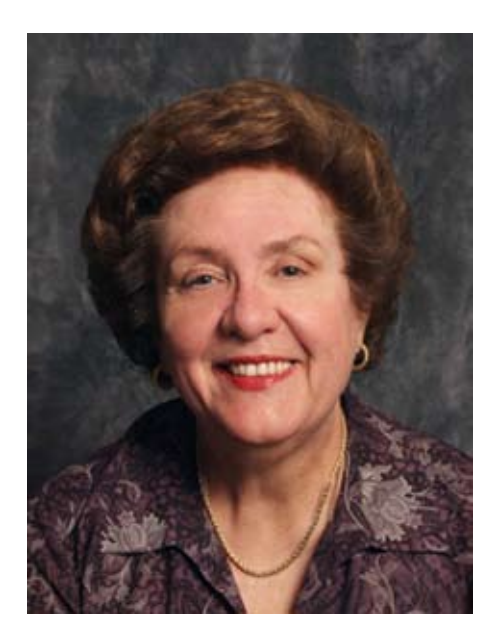
"Driscoll Hall is more than a building.... Most of all, it is a symbol of the future."

I enthusiastically invite you to visit us at Driscoll Hall, to meet with our students and faculty, and to share your news with all of us and one another through Villanova Nursing .